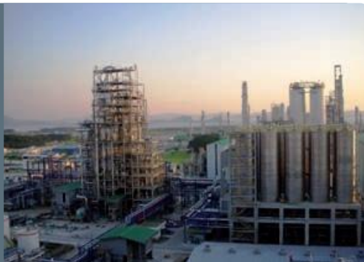
Spherizone plant – SamsungTotal, Daesan, South Korea

LyondellBasell's breakthrough Spherizone multi-zone circulating reactor process provides an economical and efficient method of manufacturing a wide range of high-quality polypropylene and novel, propylene-based polyolefinic resins. Since the launch of the Spherizone process in 2004, more than three million tonnes of capacity have been licensed.