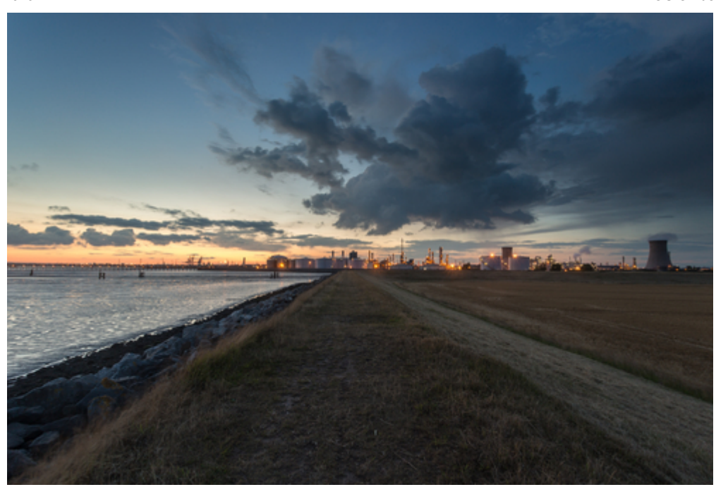
INEOS Oxide site at Saltend, Hull.