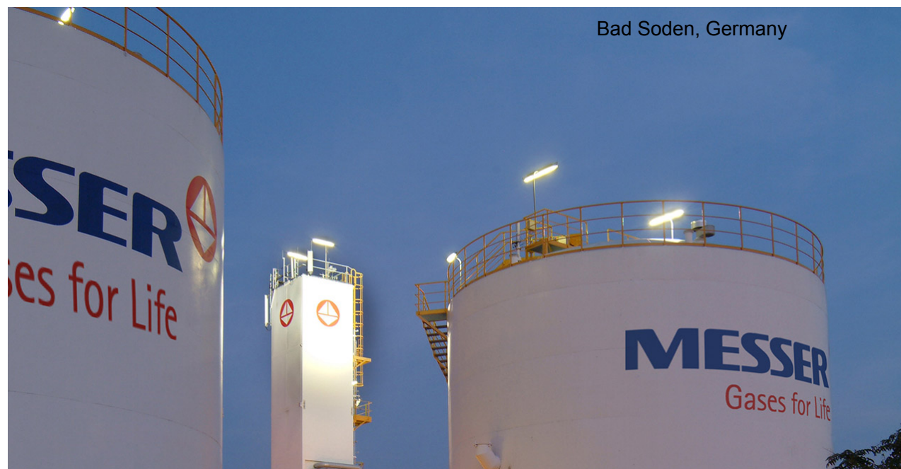
Bad Soden, Germany

Image brochures ( https://www.messergroup.com/image-brochures )