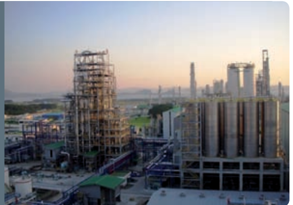
Spherizone plant – SamsungTotal, Daesan, South Korea

LyondellBasell's breakthrough Spherizone multi-zone circulating reactor process provides an economical and efficient method of manufacturing a wide range of high-quality polypropylene and novel, propylene-based polyolefinic resins. Since the launch of the Spherizone process in 2004, more than three million tonnes of capacity have been licensed.