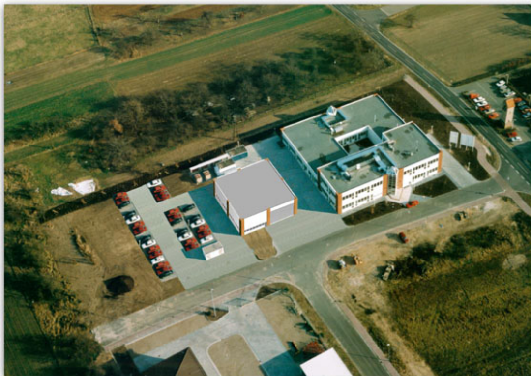
Artist's conception of the completed Europe PPS Technical Center from the air (square-roofed building in the center)

Start of operations: November 2015 (Analysis-related operations are expected to start in September 2015)