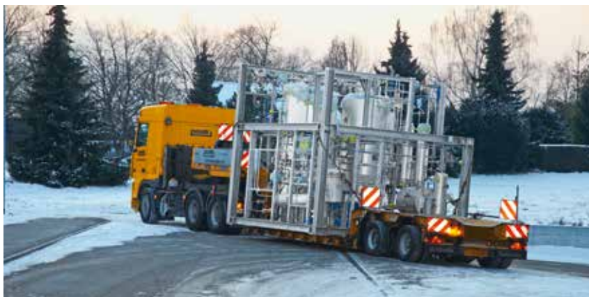
Our skid-mounted PLA plant on its way from our workshop for installation at the production site

We offer a complete technology package, including our proprietary key equipment, delivered with guaranteed performance. As our customer, we provide you first class engineering and commissioning support for the start-up of your plant. We support your in-house development with