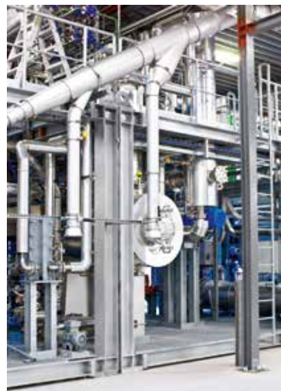
Sulzer PLA production plant at one of our customers

Since 2012 we own and operate a complete 1,000 t/yr PLA production unit. This unit can produce customer-specific grades and enables us to provide you with large quantities of sample material for in-house evaluation, industrial testing and product development. Samples are available either in 20 kg bags or 600 kg octabins. For specialties and product samples in smaller quantities, we also offer customer testing in our own dedicated, state-of-the-art R&D facilities.